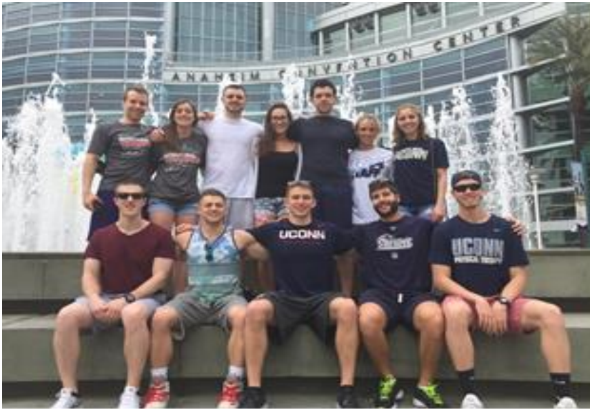
Students from UCONN outside the Anaheim Convention Center

Students and faculty from Sacred Heart, Hartford and UCONN were able to attend the Combined Sections Meeting (CSM) in Anaheim California earlier this month!!