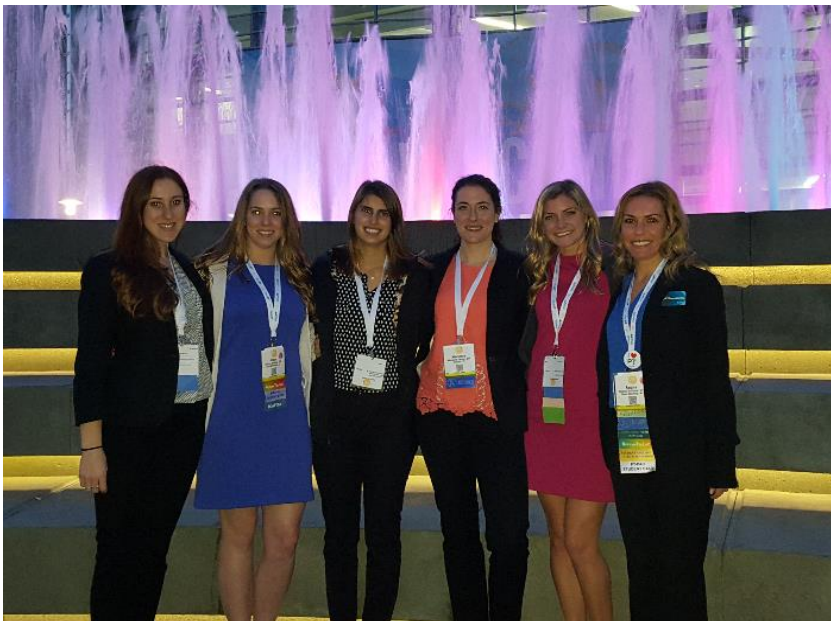
Students from Sacred Heart after a successful day of education sessions and networking!!