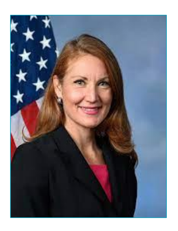
Rep. Melanie Stansbury (D-NM)